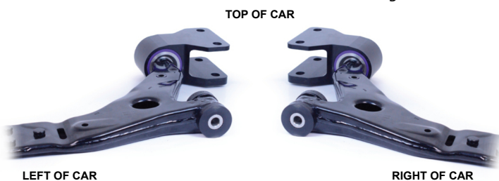
Figure 4 - Right-hand and left-hand bush and bracket assembly